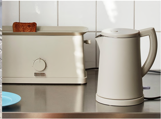
Be inspired by casualwear in layered neutral hues for fashion, while tonal pattern updates beauty looks and interior pieces have matte finishes