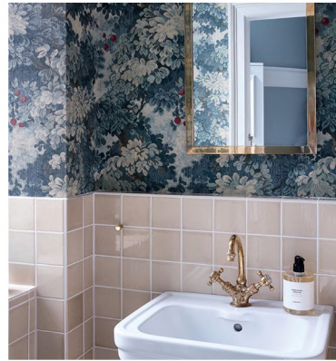
Be inspired by a contemporary take on 1940's fashion, while interiors mix vintage finds with faded floral wallpapers and pastel tiles