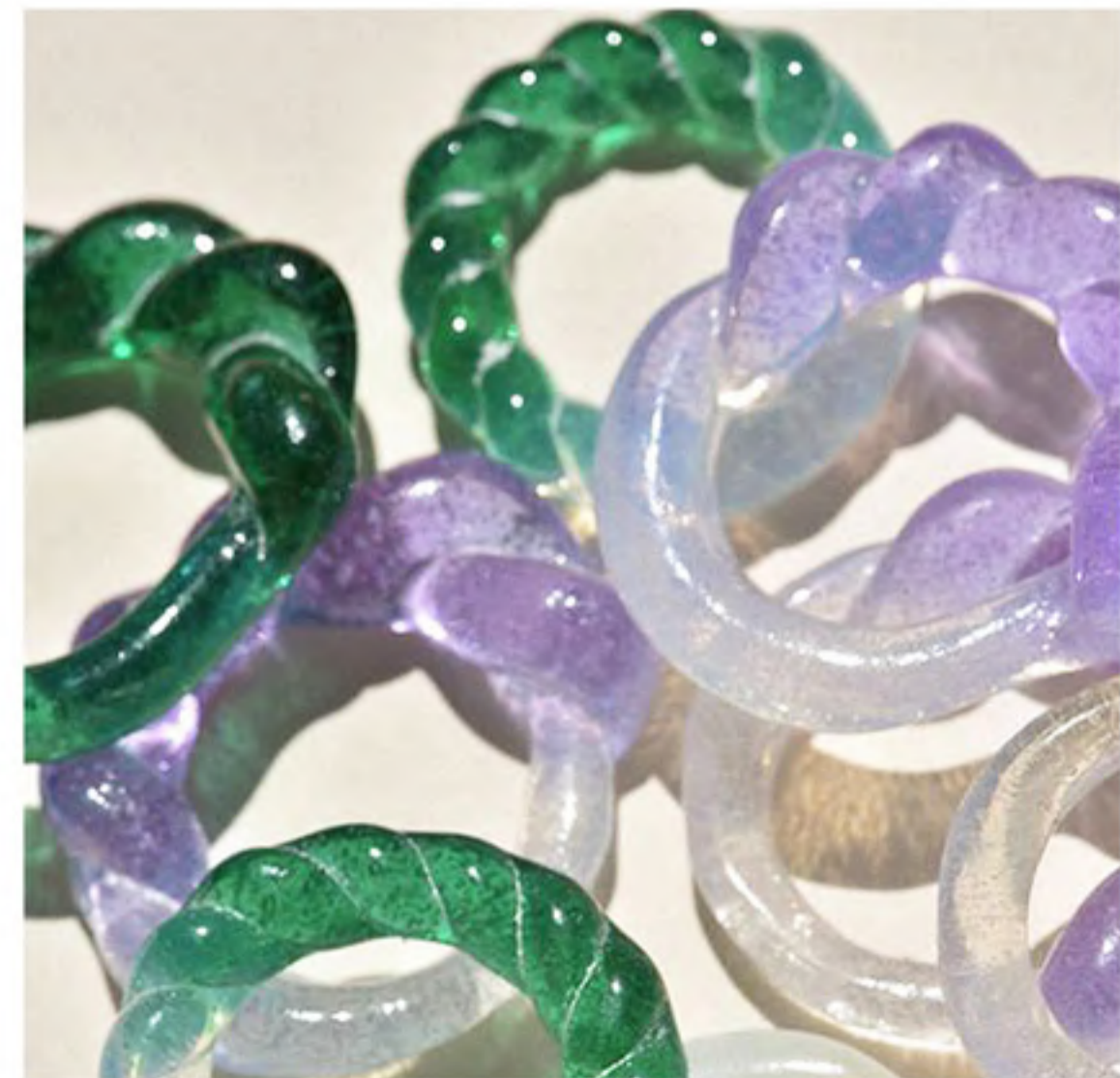
Be inspired by high shine finishes, with satin, ruched and quilted textures for fashion, glass accessories and glossy beauty and homeware looks