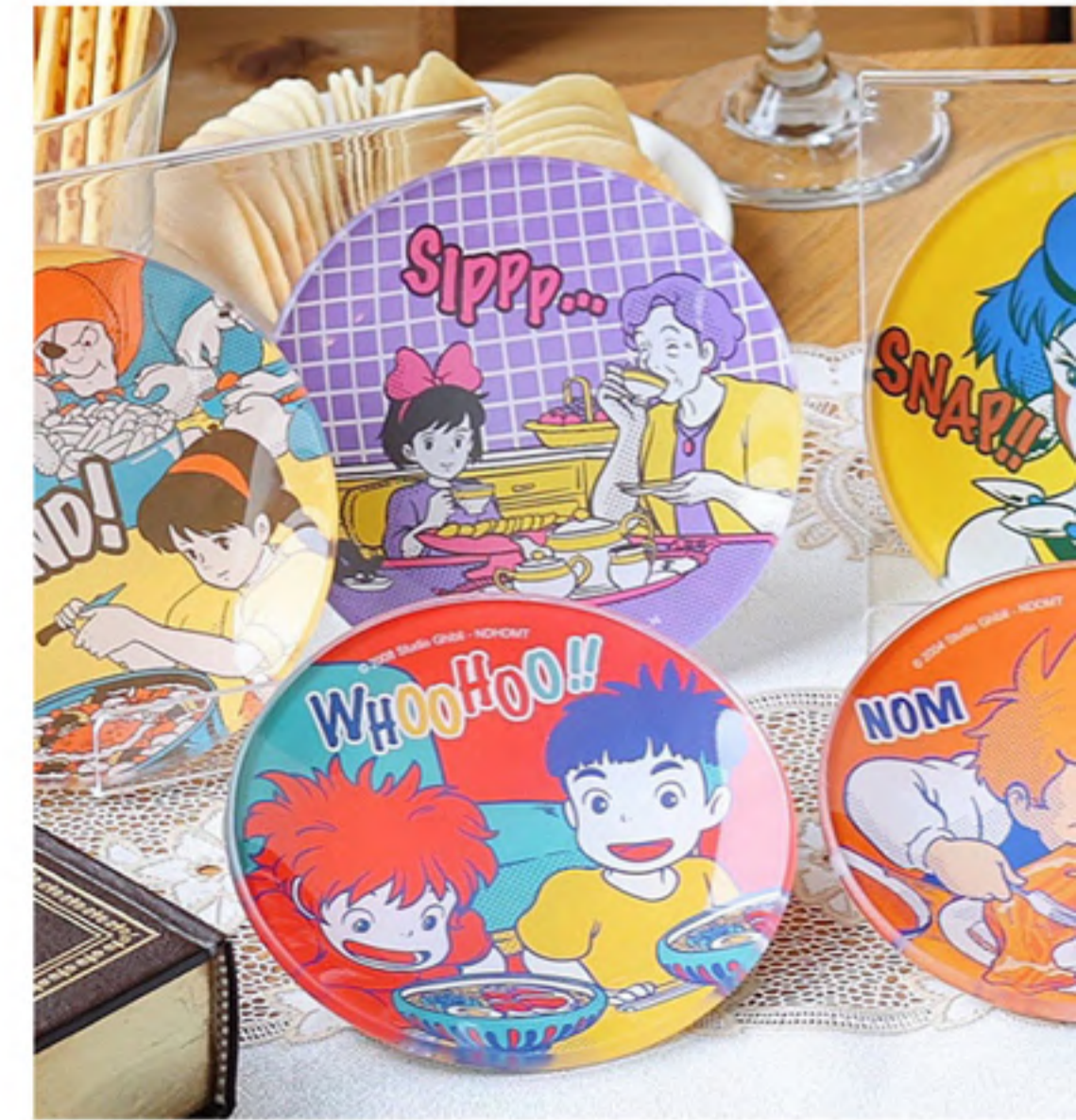
Be inspired by Japanese cartoon graphics with key Anime characters applied to clothing and homeware, whilst beauty details hint at the genre