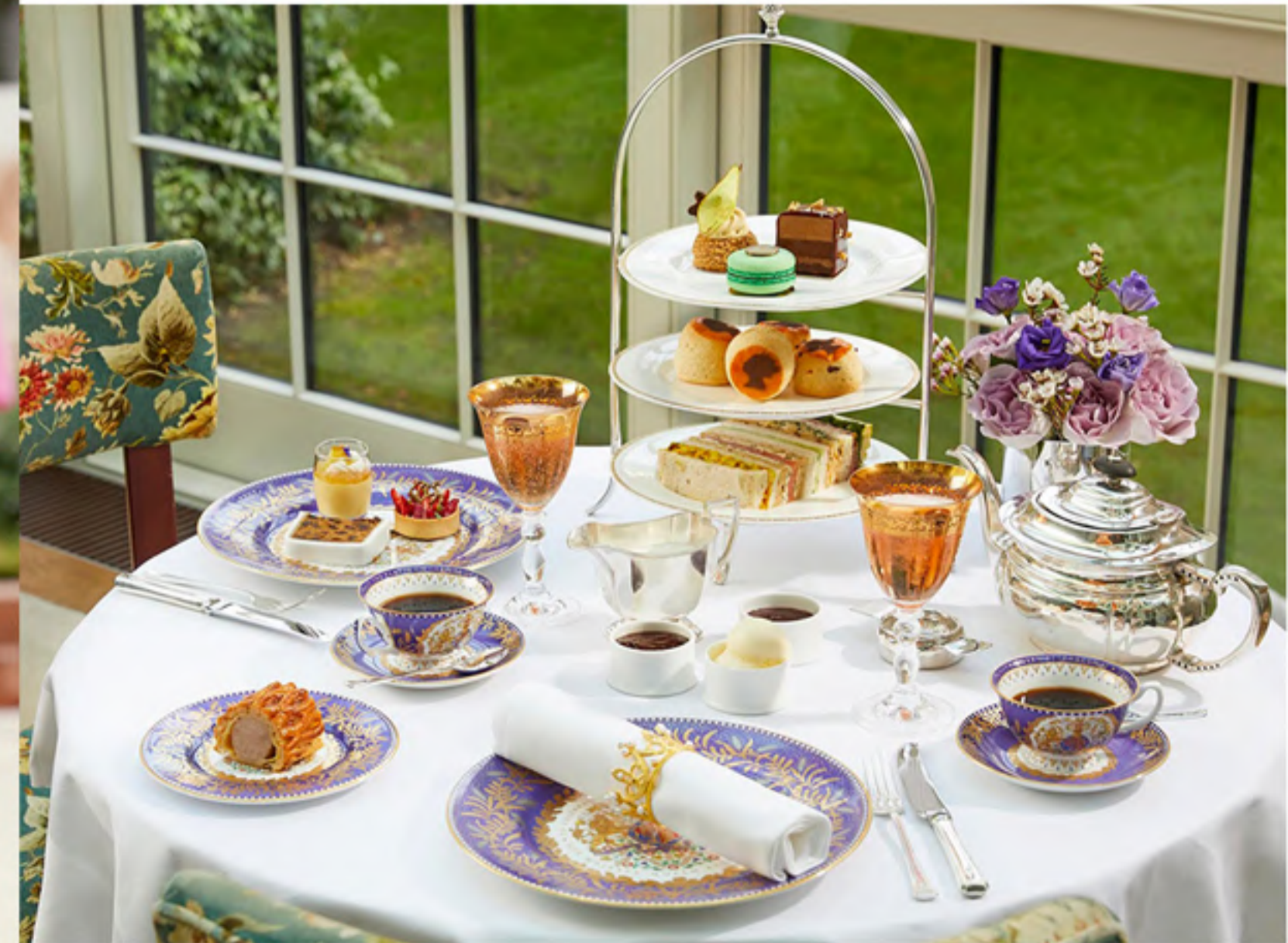
Be inspired by co-ordinating fashion sets, headscarves and monogrammed accessories, regal interiors and celebratory tablescapes