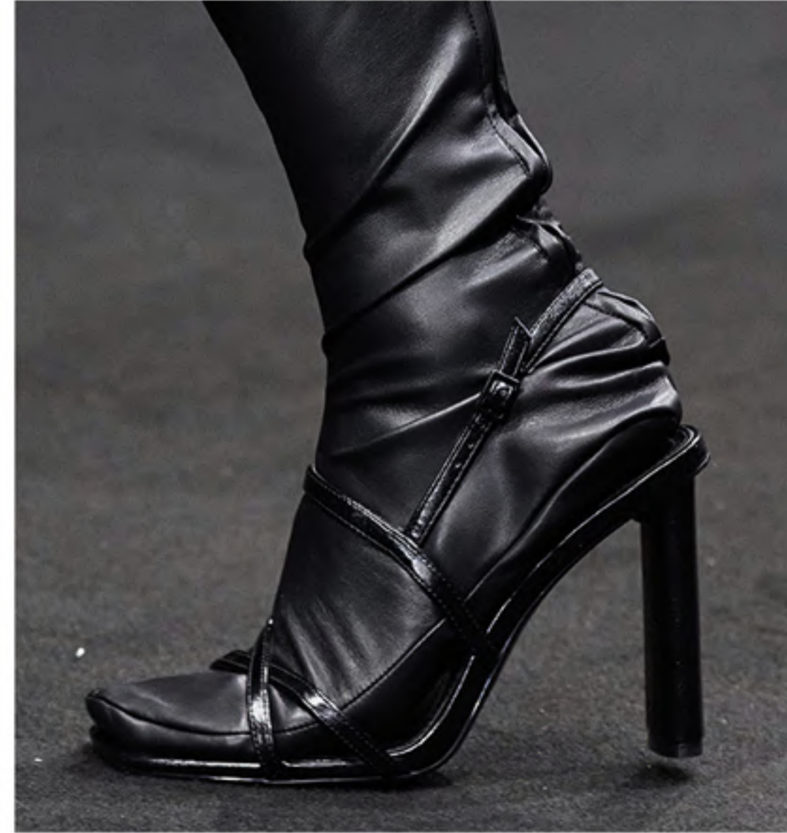
Be inspired by new iterations of the classic biker jacket and boots for womens and menswear, and leather and checkerboard features for interiors