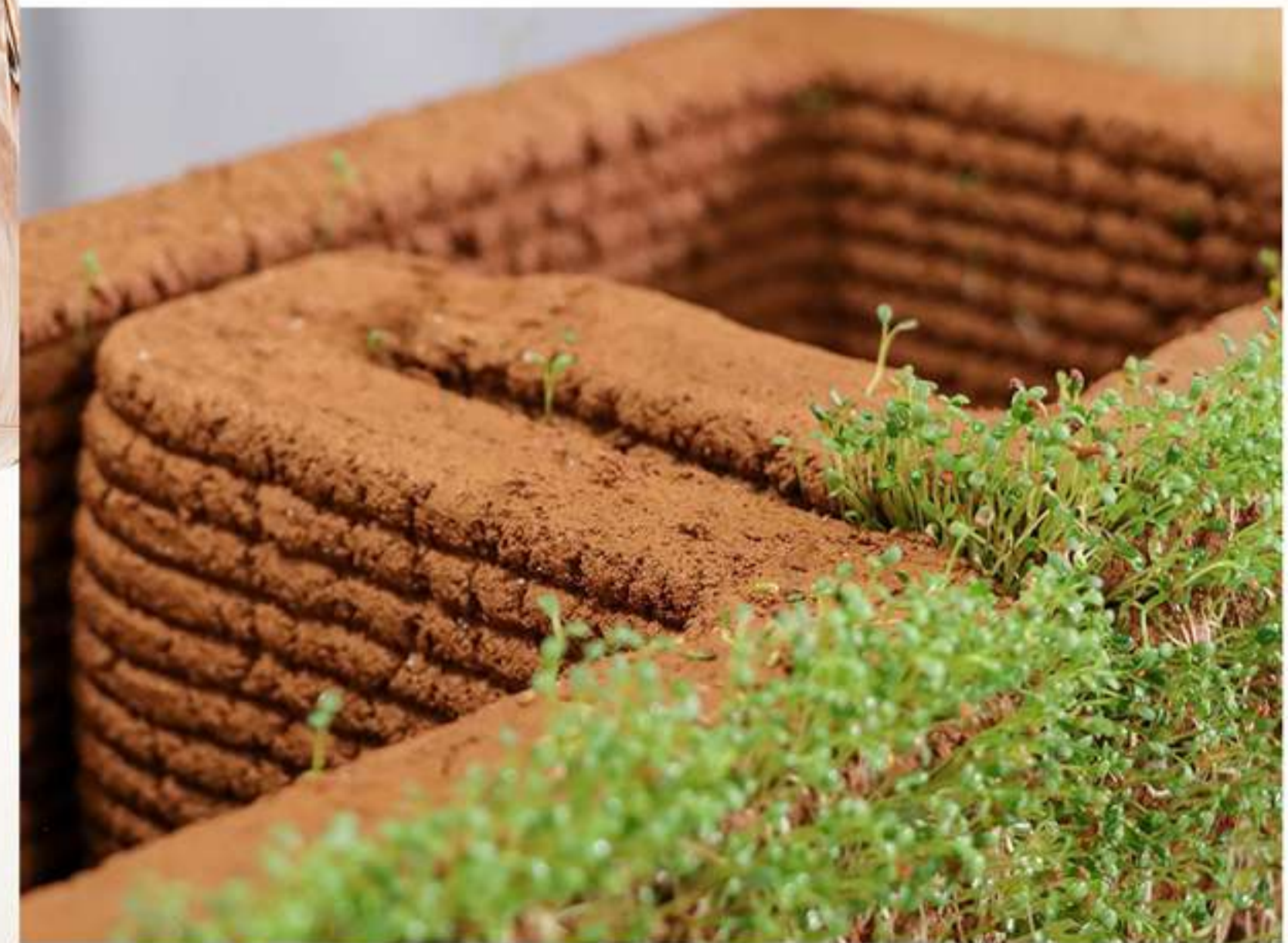
Be inspired by fashion and design that encourages a connection to the natural world, through print, imagery or physically embedded seedlings